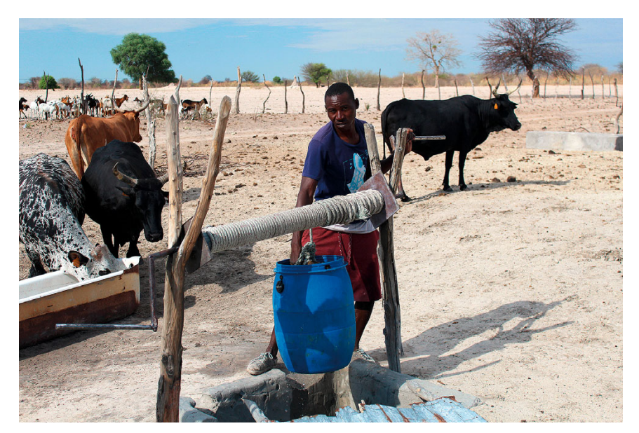
Figure 3: Extraction of shallow groundwater by wells with grazing livestock affecting groundwater quality in the Cuvelai region, Namibia.

for human use but studying these is as complex as accessing them for use. With their research, Himmelsbach et al. (2018) provide valuable insights into the methodology for groundwater prospecting in southern Africa. The focus was on creating a holistic strategy for groundwater exploration that is largely based on methods of oil and gas exploration. New scientific findings based on interdisciplinary research suggest the existence of further strategic groundwater resources that are related to large tectonic features on the continent, as well as intra-continental and coastal river deltas.