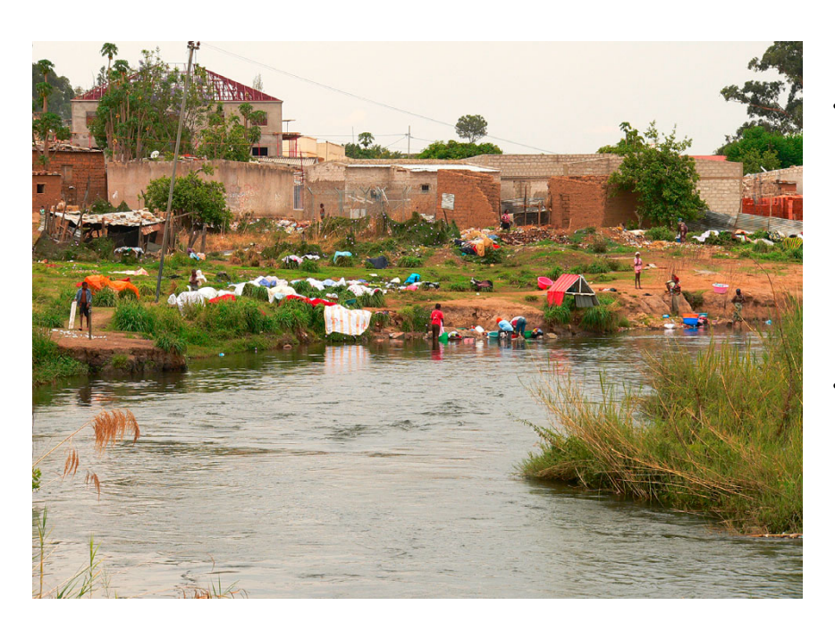
Figure 1: Uncontrolled use of open water for domestic purposes with effects on water quality for downstream users in Menongue, Angola.

water resources management must consider trigger mechanisms, tipping points, and cascading effects at a regional or even larger scale. Numerous transboundary and regional agreements, institutions, commissions, and governance instruments have been or need to be established to jointly manage important water-related ecosystem resources and services and to develop novel, innovative utilisation options. All these examples strengthen the notion that, in addition to the local grassroots level and the national priority of informed political decision-making, it is essential to address the regional dimension of environmental change with validated, knowledge-based information.