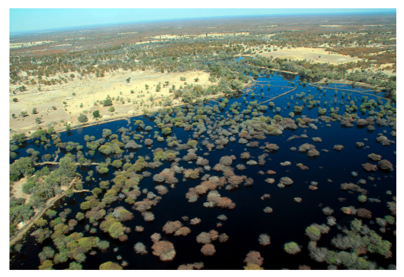
Figure 5: Fishery structures in the Okavango Delta, Botswana.

systems in the Western Cape. The fieldbased case study of a classic, discontinuous gully system in the Swartland quantified sediment movement at hillslope scale and related it to rainfall and field observations of gully activity. This showed that the gully system is not only an active sediment source, but also a conduit for sediment from hillslopes. It was further noted that agricultural practices such as ploughed contour banks are causing the expansion of the gully network, in addition to delivering sediment from hillslope sources to the gully system. Vegetation cover was found to reduce gully erosion temporally by up to 91.6%.