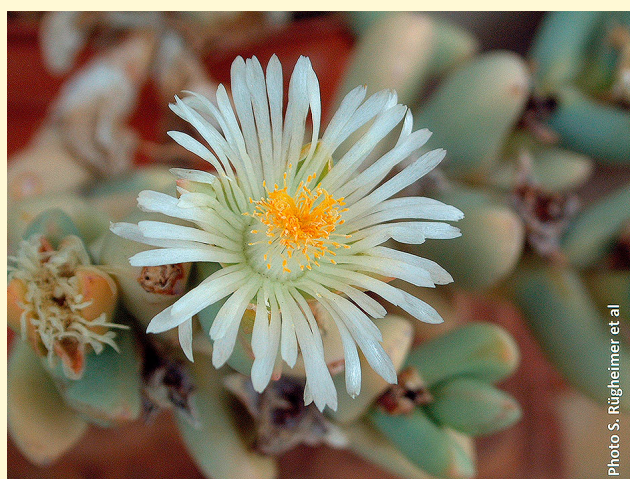
Figure 3: Juttadinteria alba (L. Bolus) L. Bolus.