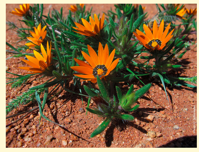
Figure 2: Gorteria diffusa Thunb. South Africa/Namaqualand/ Soebatsfontein.