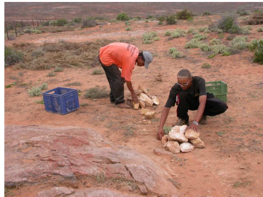
Figure 3. Paraecologists setting up a field experiment, Namibia.

Paraecologists (Fig. 3) play a key role in supporting the annual field work of researchers. Their local knowledge, supplemented by on-the job training means, they can work independently on specific tasks, with minimal quality control check by researchers. Paraecologists' routine tasks include soil sampling, annual vegetation and animal monitoring, as well as liaising with local land users. This qualified support by the paraecologists is of great importance for the pace of the annual monitoring work, which otherwise is very time consuming. Table 3 gives examples of paraecologists' activities over the last years.