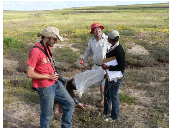
Figure 2. Custodians of Rare and Endangered Wildflowers (CREW) searching for plant species, South Africa.

Valuable support to biodiversity research: Information collected by custodians (Fig. 2) has helped to prioritise species that are in need of conservation attention by playing a vital role in the determination of a species red list status. Custodians have played key roles in extending the known range, in identification and in rediscovery of species, particularly those that have not been seen in the wild for decades (Tables 1 and 2). One such example is that of the flower Wurmbea capensis , rediscovered in 2004, having previously been collected only in 1932. As of 2007 there are 12 such ‘rediscovered’ species. Often, findings have also led to new research, for example, field observation of populations of the very rare terrestrial orchid Corycium microglossum , has led to investigations regarding the survival of its pollinators.