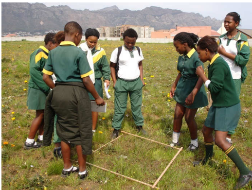
Figure 4. Students participating in Plant Monitoring Day, South Africa.

Side by side with their biodiversity monitoring activities, paraecologists are also involved in environmental awareness-raising among members of their community. Paraecologists are also active in writing and initiating newsworthy articles of relevance in their local media. Commendably, they have also been active in designing their own projects e.g. monitoring of scorpions, collection ethnobotanical information and educational story telling (Pröpper & Gruber 2007). They have also been given opportunities to present their work at regional conferences in Southern Africa. In return, their involvement in local activities has often helped communicate local community research needs and concerns to researchers.