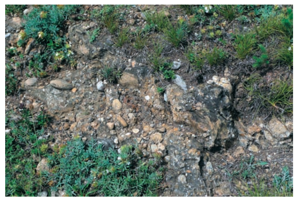
Fig. 4: Stony steppe showing open vegetation and frequent Teucrium montanum . Abb. 4: Offene Felssteppe mit Teucrium montanum .