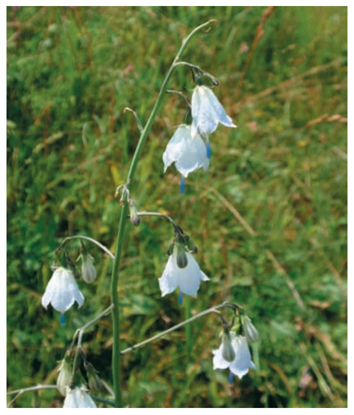
Fig. 3: Adenophora lilifolia , one of our rarest species and a plant of the mesic-xeric ecotone. Abb. 3: Adenophora lilifolia , eine der seltensten Pflanzenarten im Untersuchungsgebiet, die im Übergang von halbtrockenen zu trockenen Bereichen wächst.