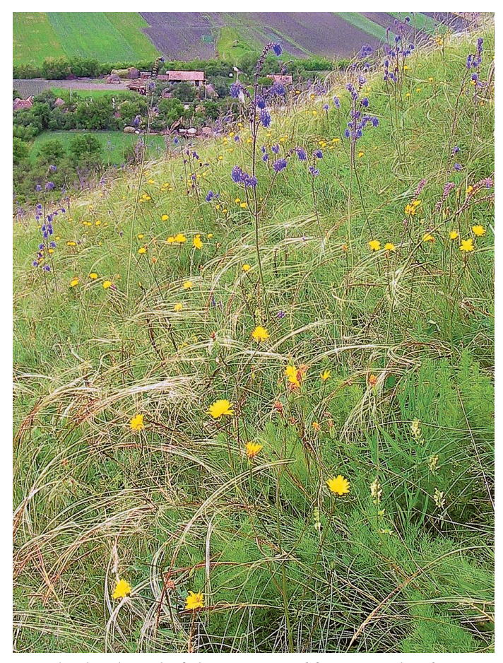
Fig. 4: Long-term abandoned stand of the Stipetum pulcherrimae with Salvia nutans, Leontodon crispus , and Adonis vernalis near Suatu (Photo: Mónika Deák, May 2003).

Ruprecht et al.qxp:Tuexenia 29 06.05.2009 10:14 Uhr Seite 359