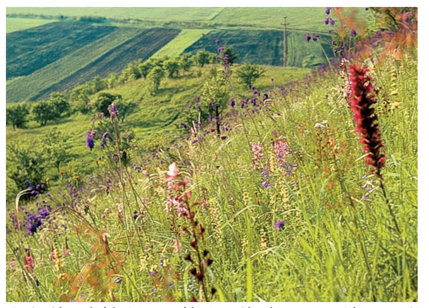
Fig. 3: Species-rich stand of the Stipetum pulcherrimae with Echium russicum, Salvia nutans, Dictam nus albus, Stachys recta, Verbascum phoeniceum , and Campanula sibirica near Mociu.

Abb. 2: Extensiv beweideter Bestand des Stipetum lessingianae mit Nepeta ucranica nahe Valea Florilor.