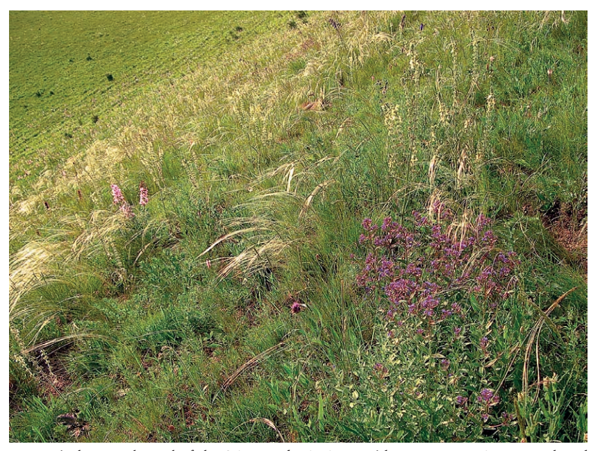
Fig. 2: Extensively grazed stand of the Stipetum lessingianae with Nepeta ucranica near Valea Florilor (Photo: András Kun, May 2003).

Abb. 2: Extensiv beweideter Bestand des Stipetum lessingianae mit Nepeta ucranica nahe Valea Florilor (Foto: András Kun, Mai 2003).