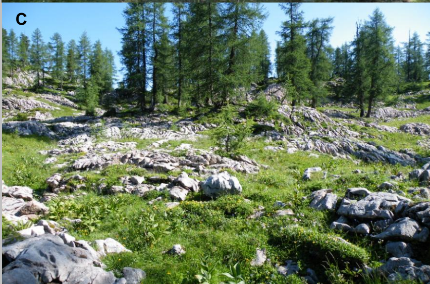
Plate: Vegetation types featured by the vegetation-plot database GIVD EU-DE-003.

A: Montane mixed deciduous-coniferous forest with Fagus sylvatica , Picea abies and Abies alba on the Teisenberg in the Chiemgau Alps.