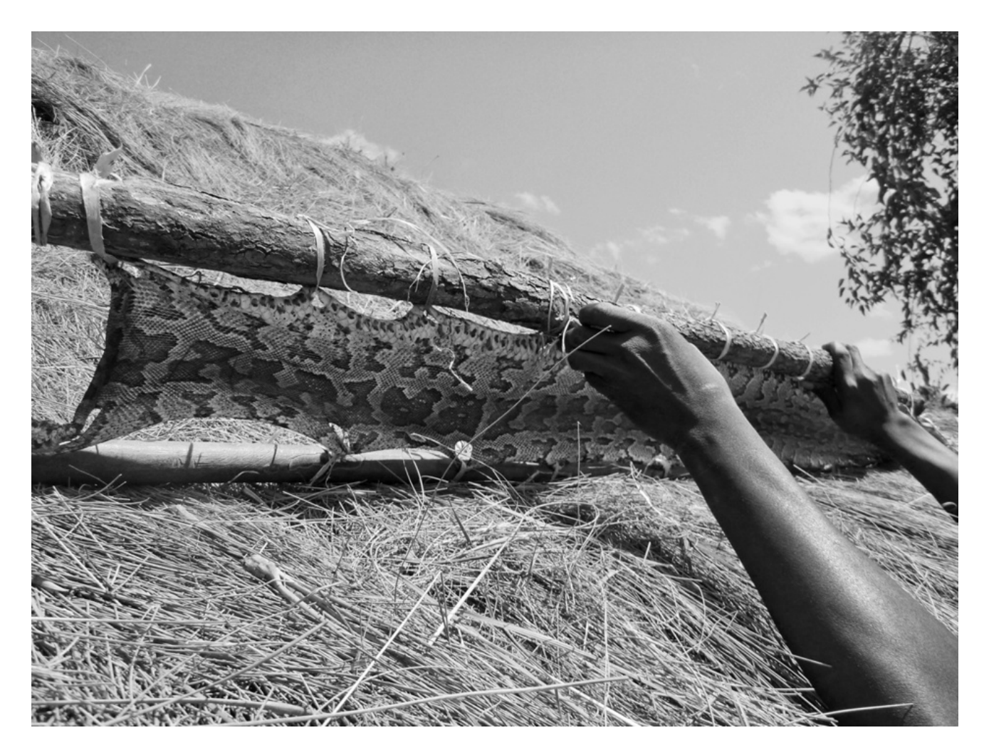
Fig. 2: Snakeskin drying on the roof of a house in Cusseque (9 May 2013).

newly circumcised young man is known, remains in the forest for approximately two weeks. While the kandantche resides in the mukanda , he is generally forbidden to receive visits from women and passes through a series of disciplinary events imposed by other adult men who remain with him.