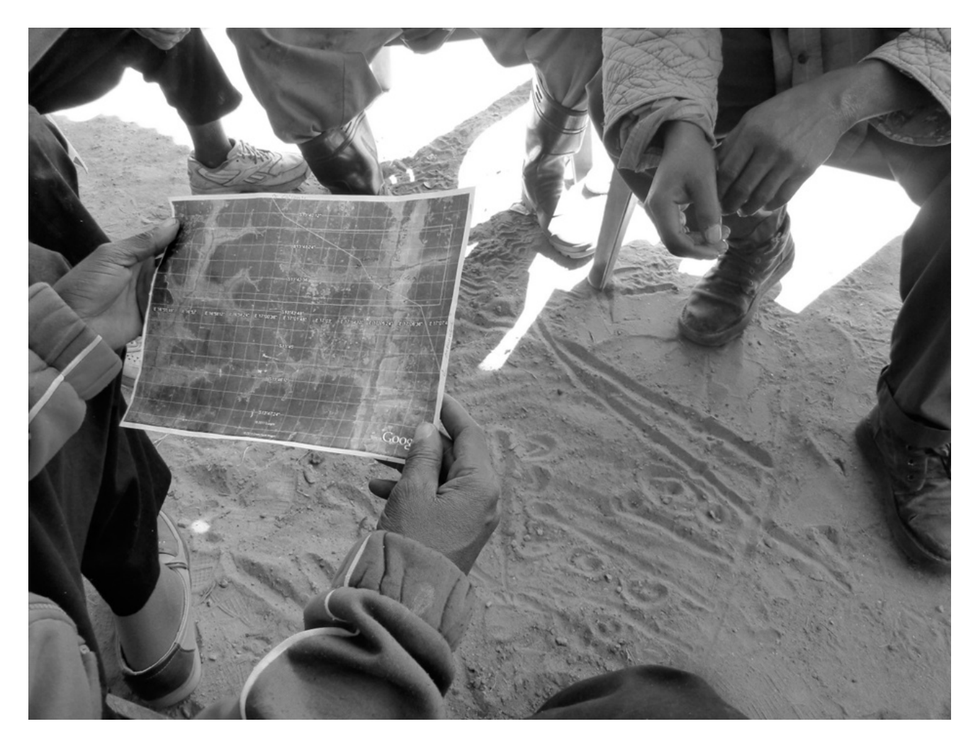
Fig. 3: Cusseque residents contemplating a Google map of the region (11 June 2011)

reliance on natural land's provisions. For example, corn and cassava, both products of the human domestication of the land, are not attributes employed in the service of witchcraft (i.e. for a curse against someone or for a defence against a course). In contrast, the dry skins of different species of snakes (see Fig. 2) that obviously reproduce through "natural processes" are highly valued for witchcraft purposes.