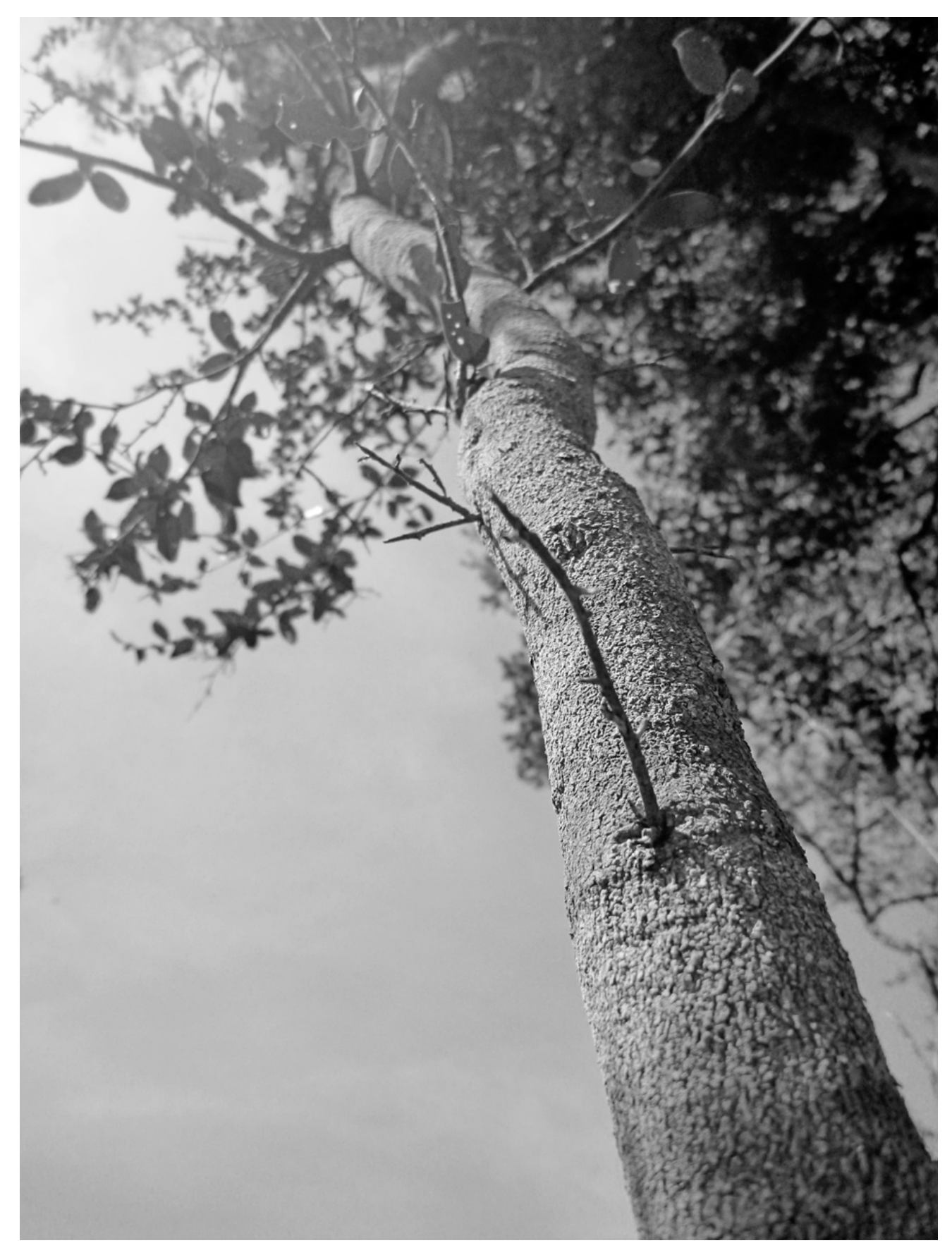
Fig. 1: Muchacha tree in Cusseque (28 June 2011).