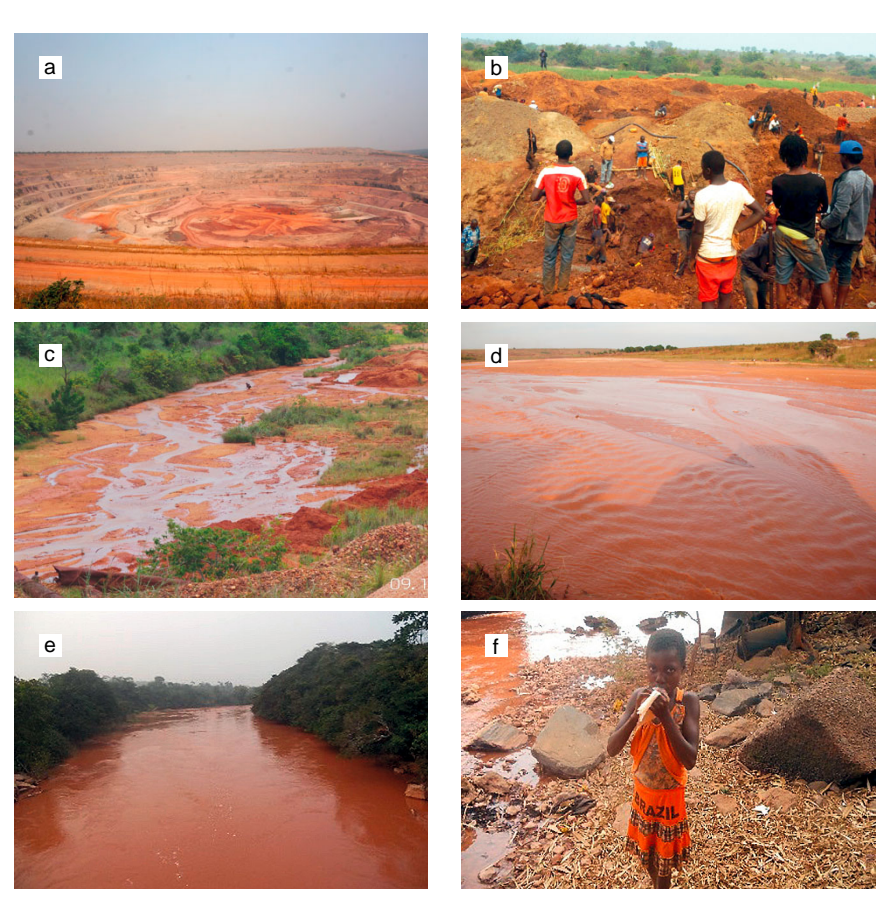
Figure 3: (a) industrial mining; (b) artisanal mining; (c) river deviation and artisanal mining along a riverbed; (d) silted river; (e) increased turbidity in river water; (f) consumption of turbid and untreated water.

Table 1 shows the land use evolution of a part of the Cuango municipality from 2005 to 2015, with respect to the areas occupied by vegetation, urbanisation, and mining activities. Notably, the increase in areas affected by mining is still larger in other municipalities (e.g. Cambulo), which implies a larger loss of natural vegetation cover there.